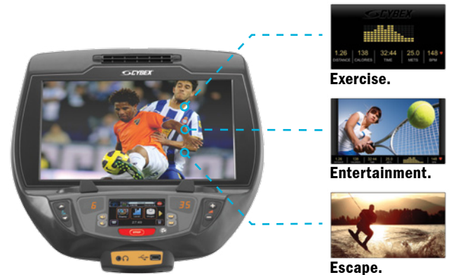
2 E3 View Optional Display