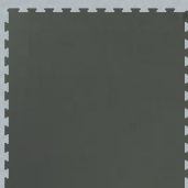
PAVIGYM STONE GREY.