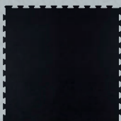
PAVIGYM JET BLACK