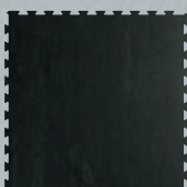
PAVIGYM B. MARBLE