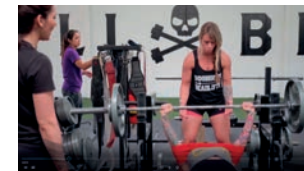
FREE WEIGHT AREA