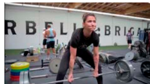
POWER LIFT AREA