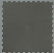
PAVIGYM STONE G