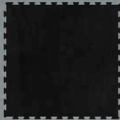
PAVIGYM B. MARBLE