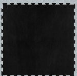
PAVIGYM B. MARBLE