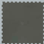
PAVIGYM STONE G.