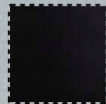
PAVIGYM JET BLACK